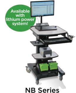
NB Series Mid-Range Unit