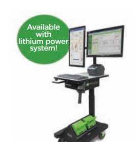
Apex Series Height-Adjust Unit