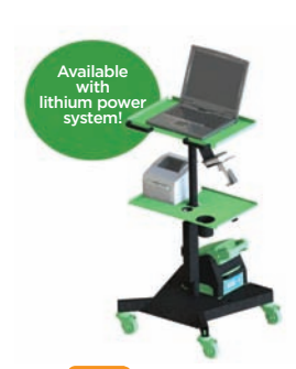
NEW! LT Series Laptop Unit Available Q2, 2020