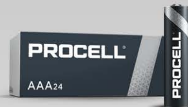
PROCELL ALKALINE AAA 24CT [ PC2400 ]