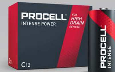
PROCELL INTENSE POWER ALKALINE C 12CT [ PX1400 ]