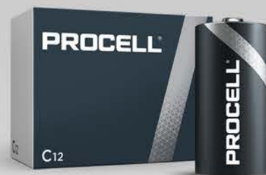
PROCELL ALKALINE C 12CT [ PC1400 ]