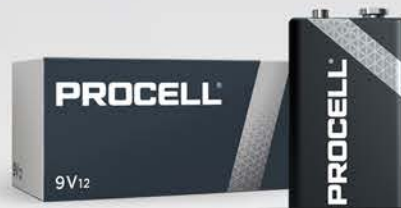
PROCELL ALKALINE 9V 12CT [ PC1604 ]