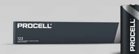
PROCELL HIGH POWER LITHIUM 123 12CT [ PC123 ]