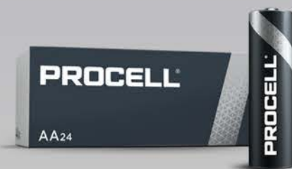
PROCELL ALKALINE AA 24CT [ PC1500 ]