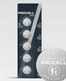
PROCELL LITHIUM COIN 2032 5CT [ PC2032 ]