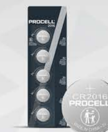
PROCELL LITHIUM COIN 2016 5CT [ PC2016 ]

*Procell Intense Power and Procell Lithium ranges will be available from November 2019