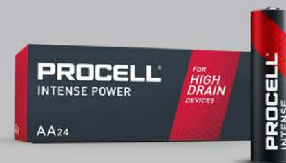
PROCELL INTENSE POWER ALKALINE AA 24CT [ PX1500 ]