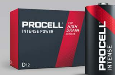
PROCELL INTENSE POWER ALKALINE D 12CT [ PX1300 ]