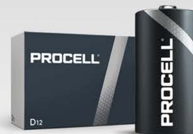
PROCELL ALKALINE D 12CT [ PC1300 ]