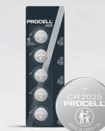
PROCELL LITHIUM COIN 2025 5CT [ PC2025 ]