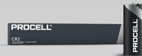
PROCELL HIGH POWER LITHIUM CR2 12CT [ PCCR2 ]