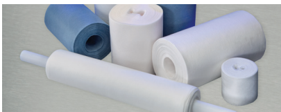
Stencil cleaning rolls (SMT) in standard and custom sizes

Keep stencils cleaner for longer and lower production costs