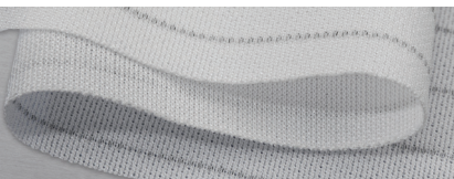
Negastat-enhanced carbon fiber wipes

Wipe away contaminants without static discharge