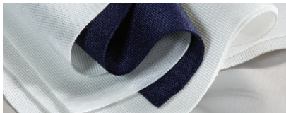
Cleanroom-ready nonwoven wipes

Clean grime and solder flux with confidence