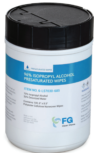
Economy-sized alcohol wipes

Quickly remove grease, inks and adhesives from equipment